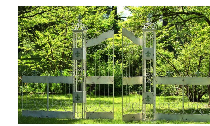
IRON GATE USED IN ZONE 2